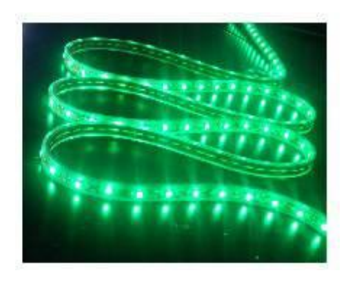
1 Roll = 5m